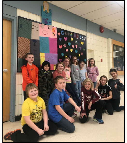
Kindness Club members with their "Good Vibes" bulletin board project.