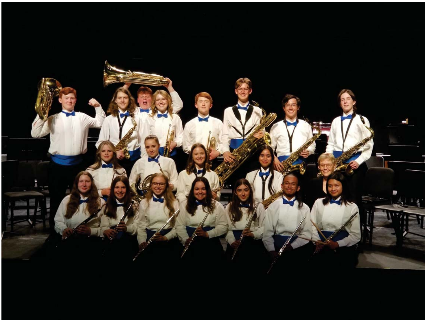
Our Senior Band looking sharp for their performance at the Moose Jaw Band & Choral Festival in May.