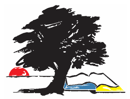
Study Manitoba School Divisions

Over the last 11 years, we have been welcoming students from around the world to the 5 school divisions represented in the Study Manitoba consortium: Beautiful Plains, Fort La Bosse, Rolling River, Southwest Horizon and Turtle Mountain School Divisions. The success of the program relies on the participation of local families to welcome and support these young people as they embark on their academic and cultural programs. What these students choose to do is very brave – they arrive in a new country to meet a new family and new friends, learn about a new country and for many, they do it all in a foreign language. They learn and grow as they go, not just academic and language skills but also in areas of cultural awareness and life experience.